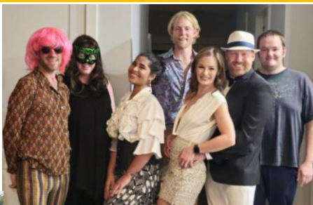
Above: The team in character for the Murder Mystery Dinner Party! Below: Receiving our clients with a little Halloween spirit this year!