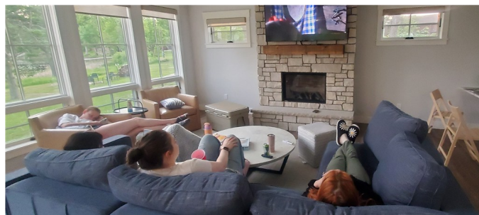
We Spent Time Making the Most Memories Possible!