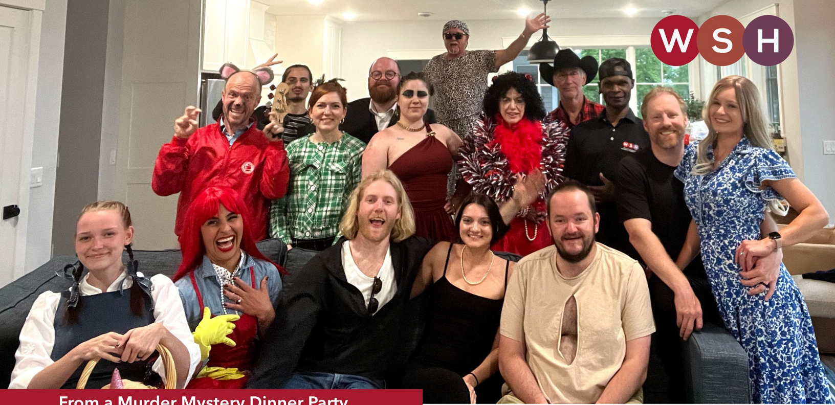
From a Murder Mystery Dinner Party