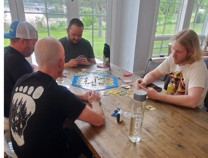
To Board Game Marathons & Relaxation